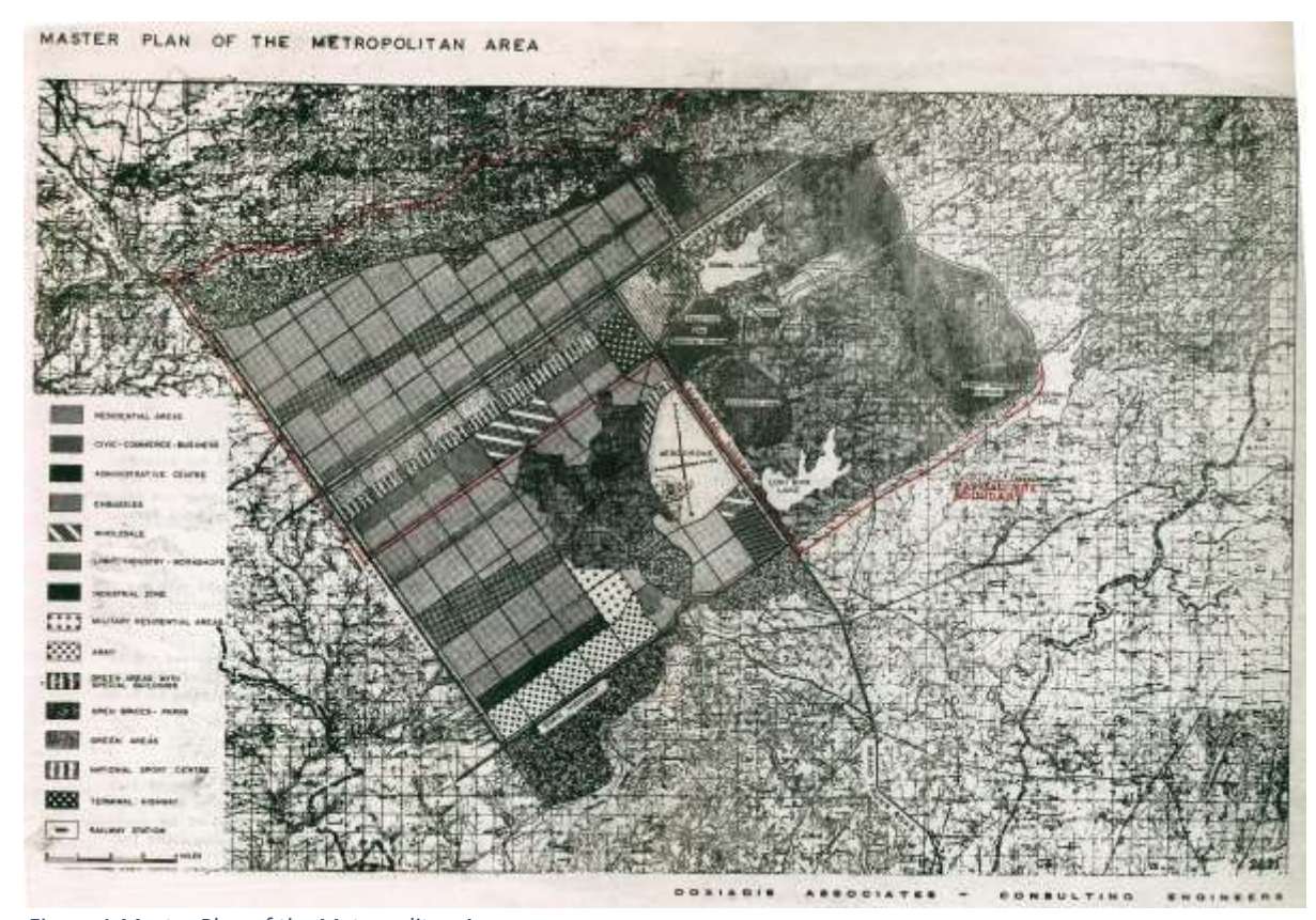
Figure 1:Master Plan of the Metropolitan Area