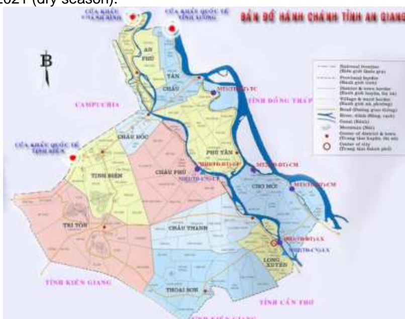
Figure 1: Location map of surface water sampling

Surface water samples were collected at 5 sampling points affected from urban areas and 2 surface water sampling points affected from industrial parks and clusters. Sample collection schedule is in June 2021 (dry season).